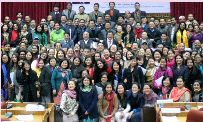
TEACHERS EMPOWERMENT PROGRAM, SIKKIM

ICSI adopts Modules for Empowerment of Teachers, Trainers and Counsellors duly approved by NCERT, Ministry of HRD, Govt. of India