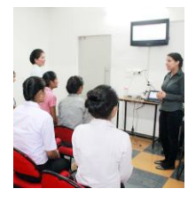
VIRTUAL ART OF COMMUNICATION