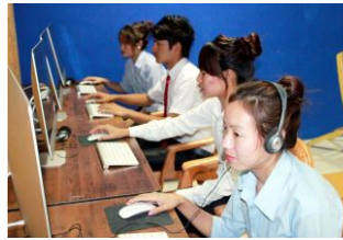
BASIC COMPUTER SKILLS