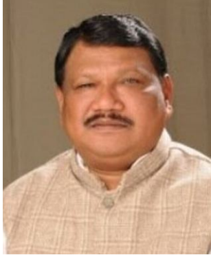
Shri Jual Oram

Hon'ble Minister of Tribal Affairs Ministry of Tribal Affairs, Govt. of India