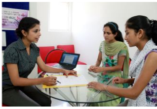
APTITUDE & PSYCHOMETRIC TEST